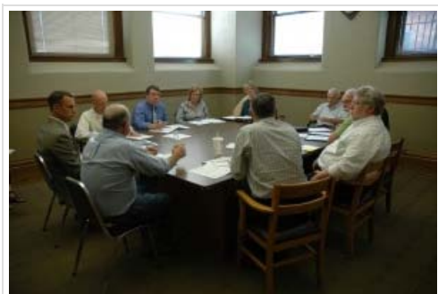
South Central Regional Airport Agency officially got underway Thursday afternoon holding it's first meeting in the basement of Oskaloosa City Hall

Oskaloosa, Iowa – Without much notice, the hard work of making a new regional airport happen started Thursday evening.